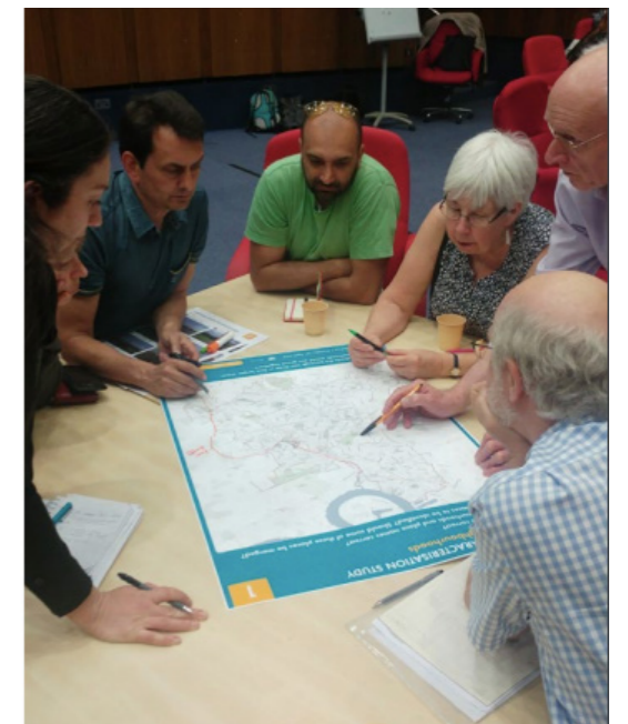
Image 1 Consultation for the Lewisham Characterisation Study