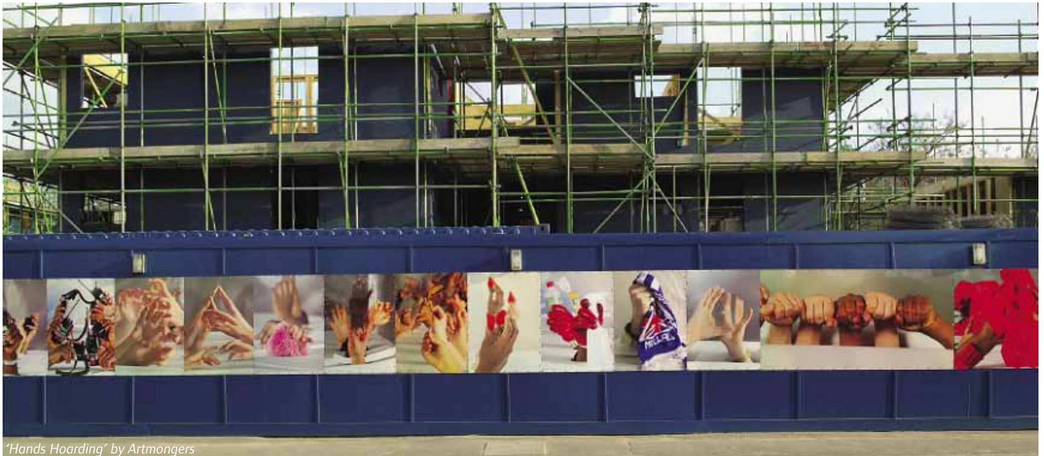
'Hands Hoarding' by Artmongers