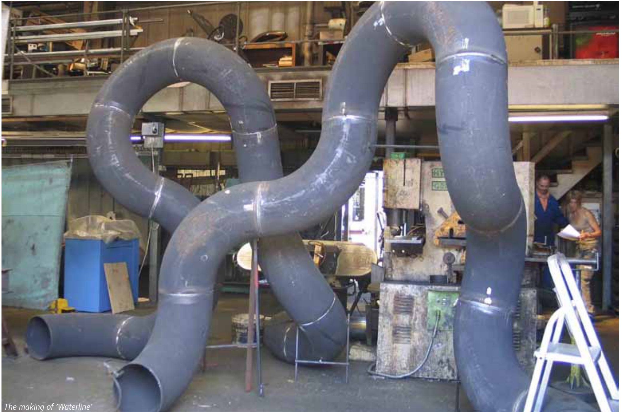
The making of 'Waterline'