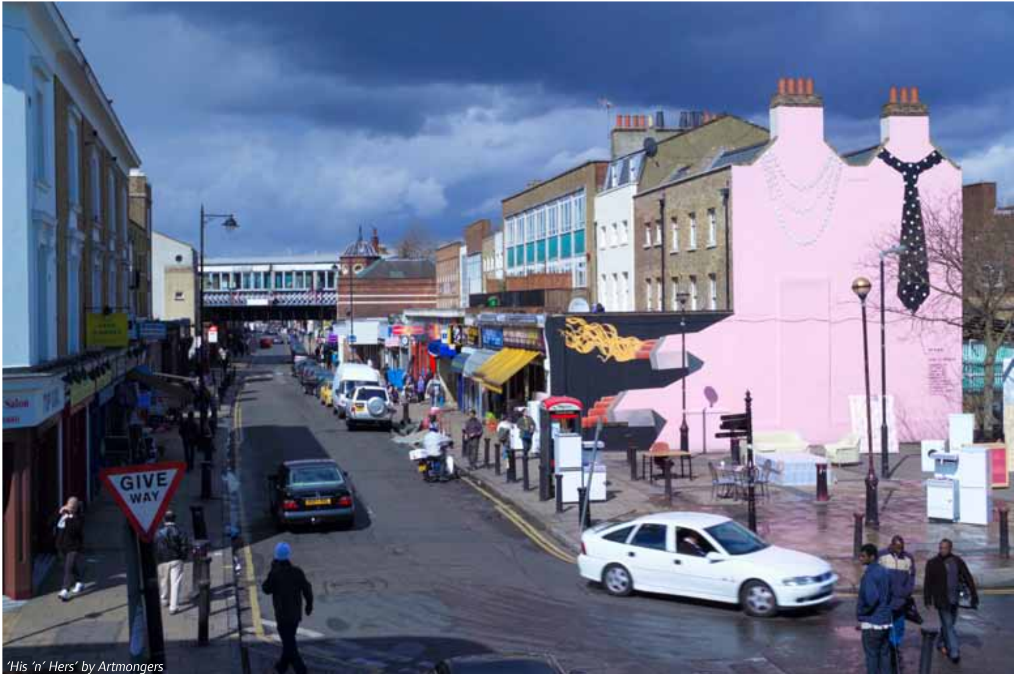
'His 'n' Hers' by Artmongers