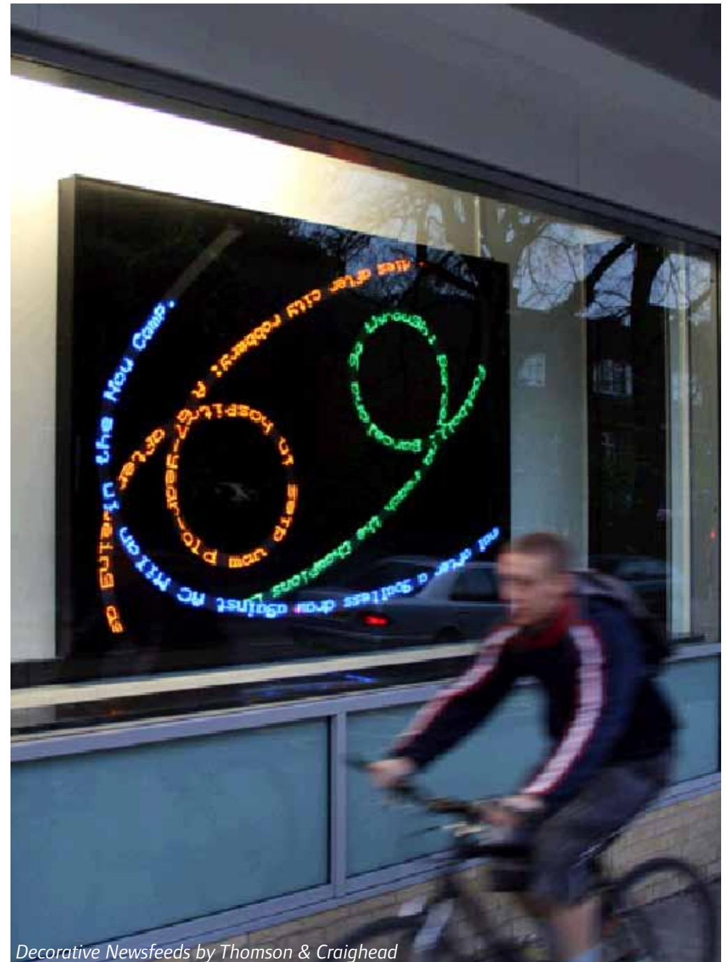
Decorative Newsfeeds by Thomson & Craighead