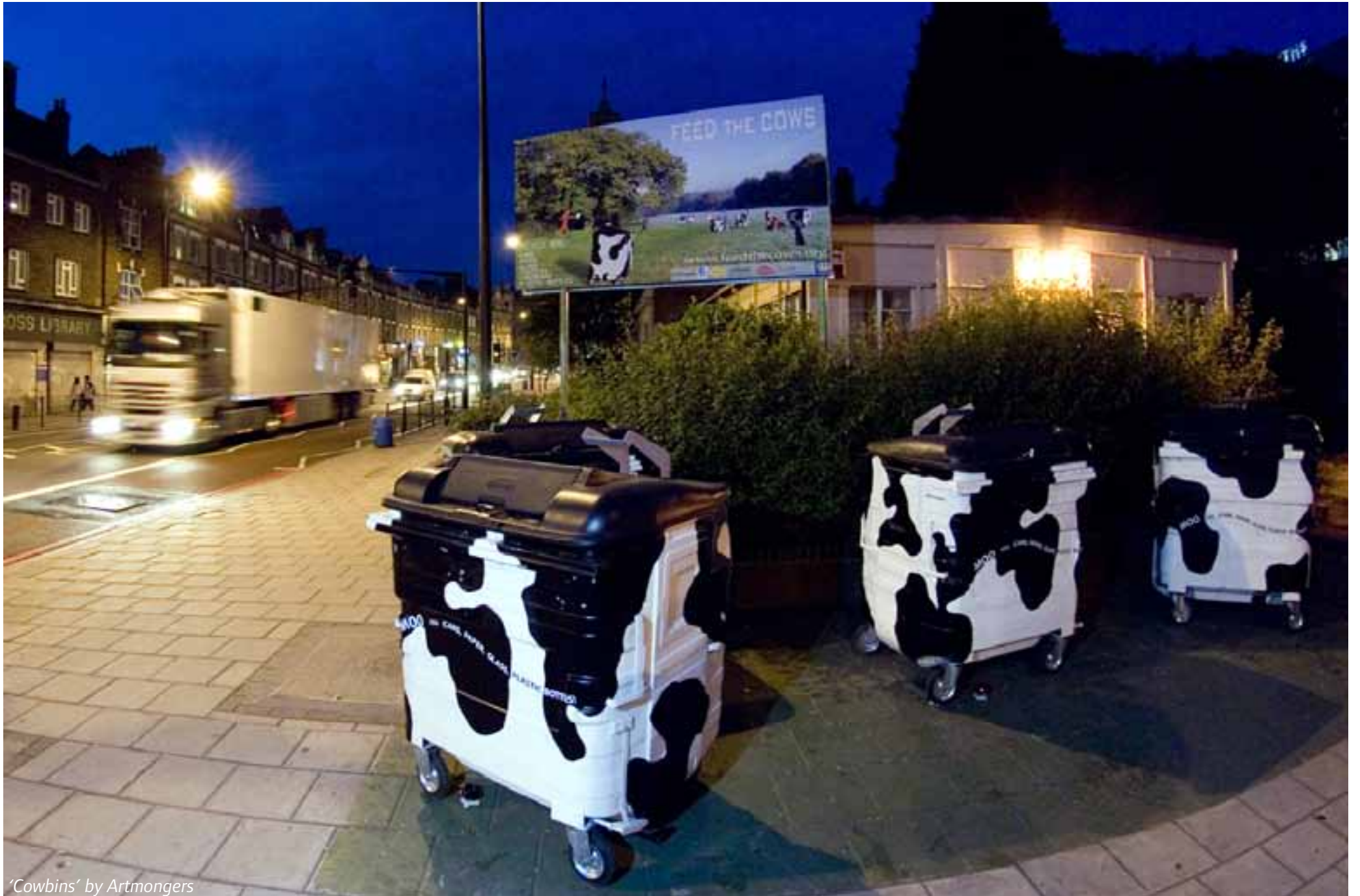
'Cowbins' by Artmongers