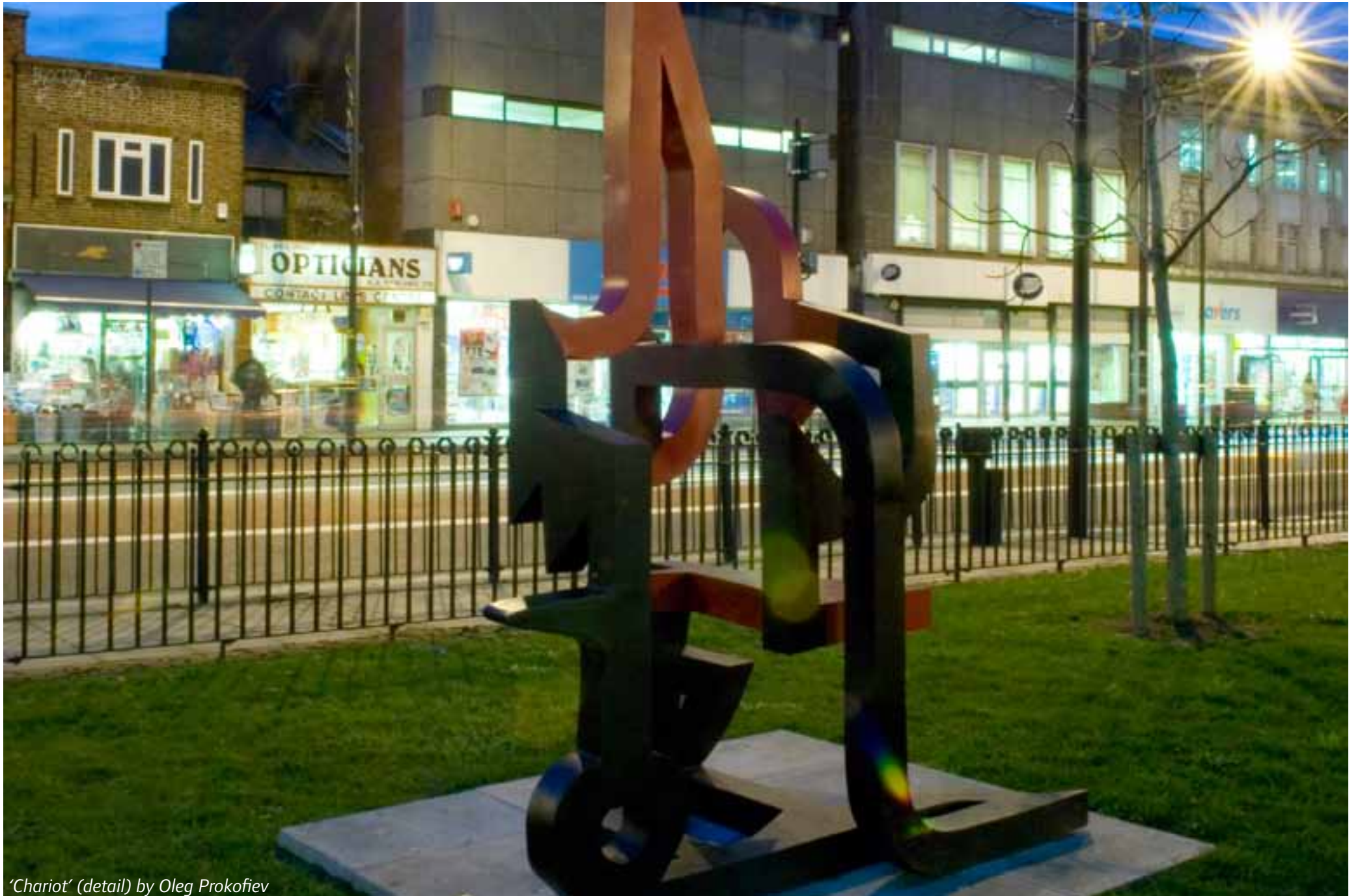
'Chariot' (detail) by Oleg Prokofiev