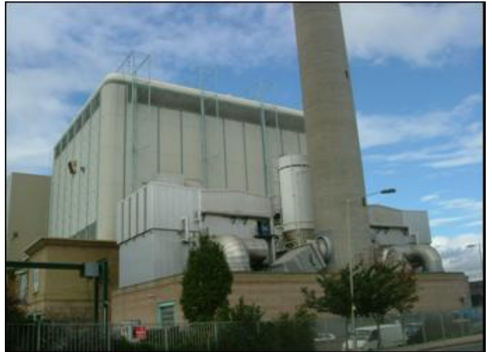
Employment Land - Lewisham Reuse and Recycling Centre