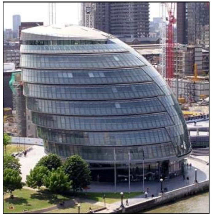
City Hall - London

At the time of print, a new version of PPS12 (Government policy regarding local spatial planning) was expected. It is anticipated that this will change the planning policy process. The Council will review the document and advise of required amendments to the process or documents as soon as possible.