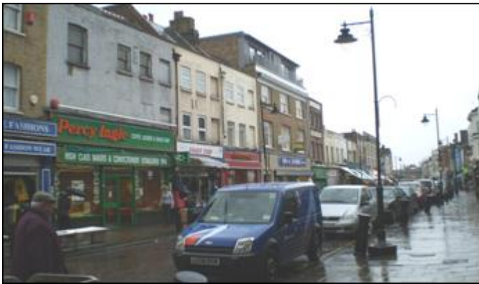
Deptford High Street