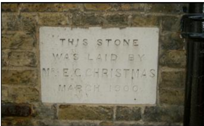
Plaque off Dartmouth Road – Forest Hill