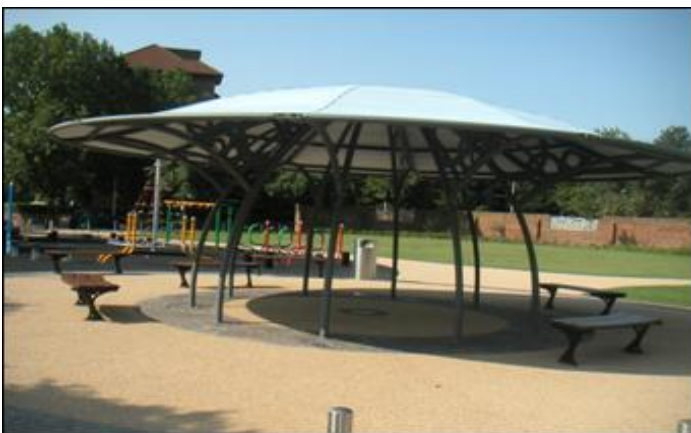
Open space with play facilities

Work is currently underway and a final draft of the report is expected in July 2008, to be available on our website.