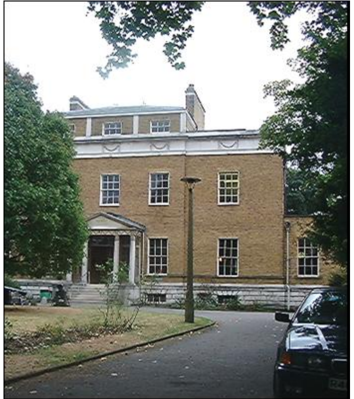
Manor House Library in Lee Manor Conservation Area

The conservation and urban design team and their consultants have now completed reviews of the Telegraph Hill and Lee Manor conservation areas. The Mayor approved officers' proposals to adopt the character appraisals and locally list buildings in both areas as well as amend the boundaries of Lee Manor Conservation Area. These items were adopted on 19 March 2008. Article 4 directions are being made to control alterations to the external elevations of family houses to preserve the character of both areas. The Telegraph Hill direction came into effect 9 March 2008 and the Lee Manor Article 4 direction will come into effect on 23 March 2008. Article 4 withdraws permitted development rights, to enable the council to control potentially harmful alterations, such as changes to roofs, windows and front gardens. Contact the Planning Information Desk for further information.