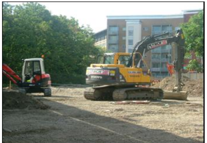
Housing Development in Lewisham

Do you agree with this approach? Would you like to see other issues covered in the SPD? Would you like to be included as a document consultee for the SPD and advised of public consultation? If so, please send your response and contact details to the Policy Planning Team.