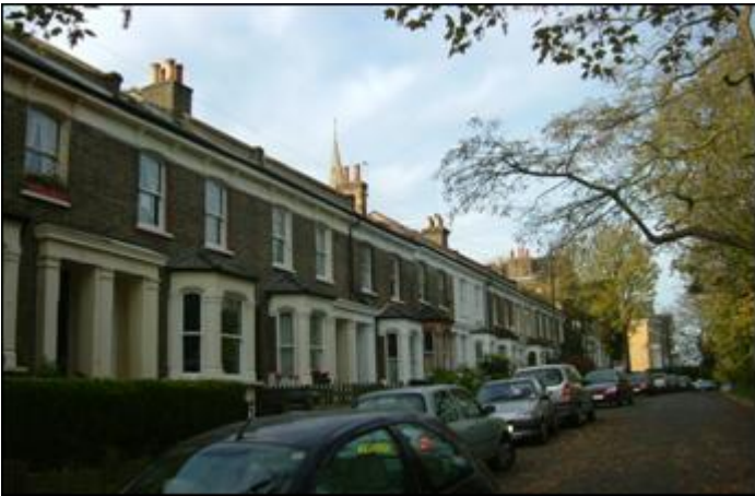
St Johns Conservation Area

All documents are available on our website: ( www.lewisham.gov.uk/Environment/Planning/ConservationAndUrbanDesign/ ).