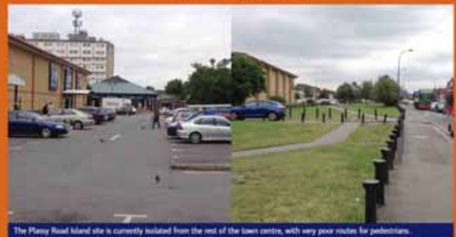
The Plassy Road Island site is currently isolated from the rest of the town centre, with very poor routes for pedestrians.