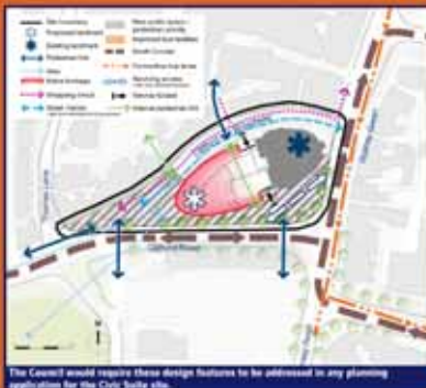
The Council would require these design features to be addressed in any planning application for the Civic Suite site.

See sections 4.3 and 4.4 of the draft Catford Plan for more details.