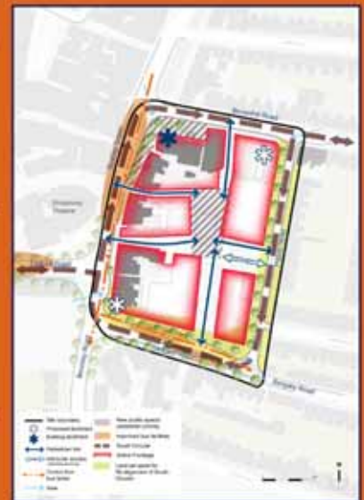
The Council would require these design features to be addressed in any planning application for the Plassy Road Island site.

See section 4.5 of the draft Catford Plan for more details.