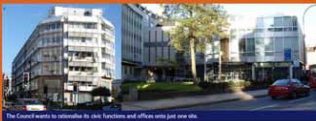
The Council wants to rationalise its civic functions and offices onto just one site.