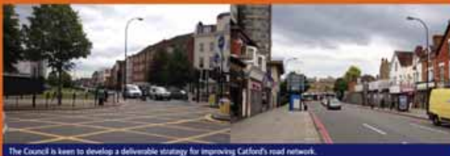
The Council is keen to develop a deliverable strategy for improving Catford's road network.