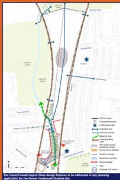
The Council would require these design features to be addressed in any planning application for the former Greyhound Stadium site.

See section 4.6 of the draft Catford Plan for more details.