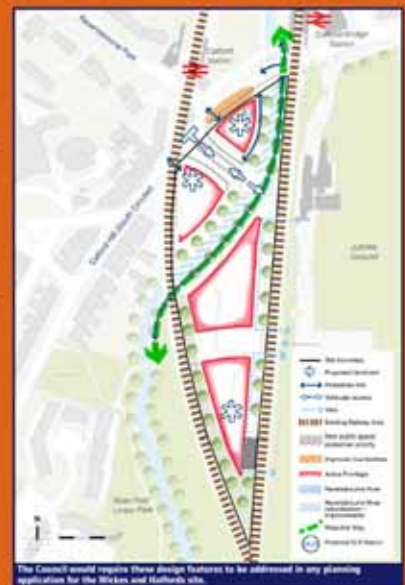
The Council would require these design features to be addressed in any planning application for the Wickes and Halfords site.

See section 4.7 of the draft Catford Plan for more details.