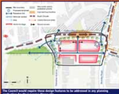
The Council would require these design features to be addressed in any planning application for the Laurence House site.