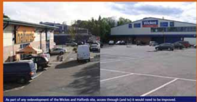
As part of any redevelopment of the Wickes and Halfords site, access through (and to) it would need to be improved.