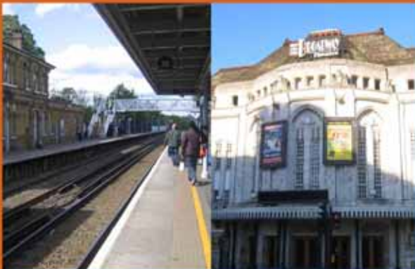
The Catford Plan will aim to enhance what people value about the town centre, such as its good public transport links and the Broadway Theatre.

The Catford Plan will aim to enhance what the community values about Catford, and drive improvements where people want change. It also has to address issues such as new housing. The Council has targets from the Mayor of London to provide around 1,000 new homes every year for the next 15 years. Many of these will be built within existing town centres to reduce reliance on cars and protect existing green spaces. In Catford, the projection is for 650 new homes by 2016 and a further 1,100 by 2026.