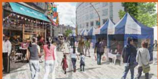
Council staff will be at Catford Broadway market on Sunday 3 March to discuss the Catford Plan and answer questions. Other consultation events are also scheduled. (See the Council’s website for details.)

Under the current timetable, the Catford Plan – including any revisions made as a result of this consultation – should be submitted to the government for approval later this year and adopted by Lewisham Council in 2014.