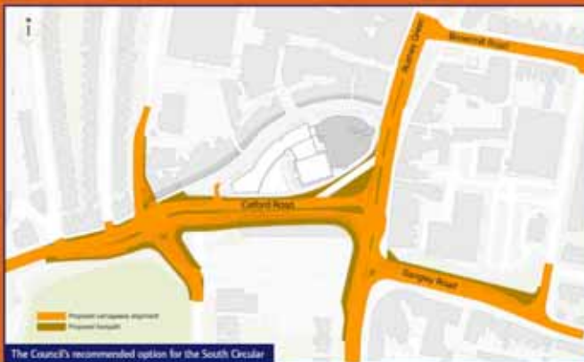
The Council's recommended option for the South Circular

See section 4.1 of the draft Catford Plan for more details.