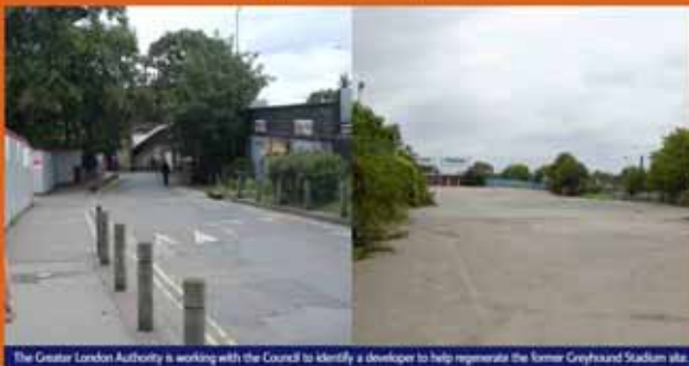
The Greater London Authority is working with the Council to identify a developer to help regenerate the former Greyhound Stadium site.