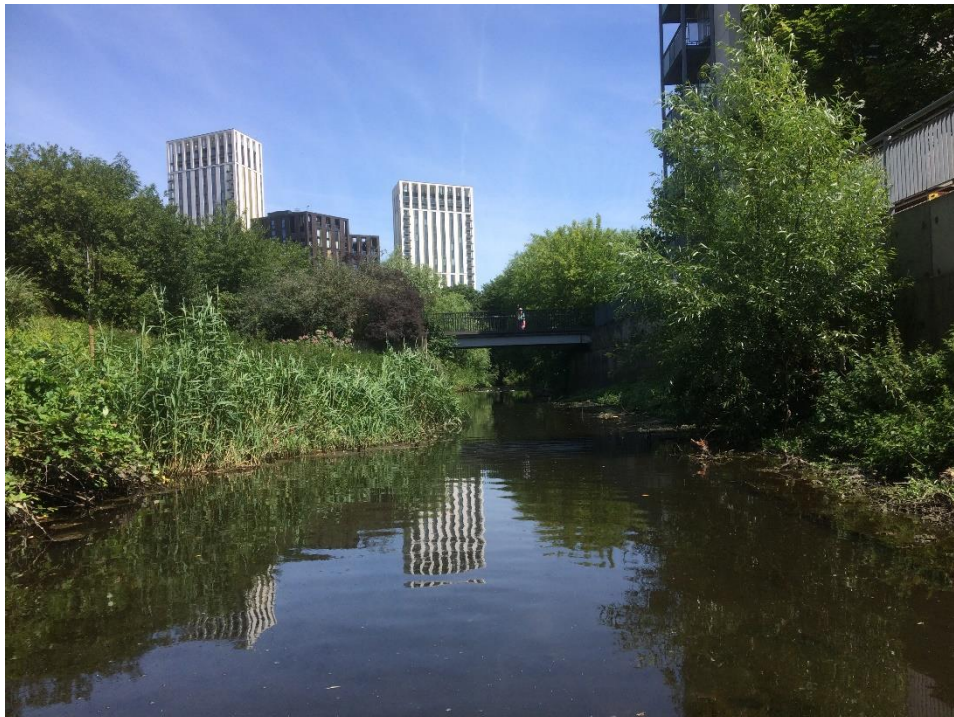
Figure 5: River Ravensbourne at Cornmill Gardens

The Local Strategy will seek to identify opportunities to deliver multiple benefits through delivering blue green infrastructure.