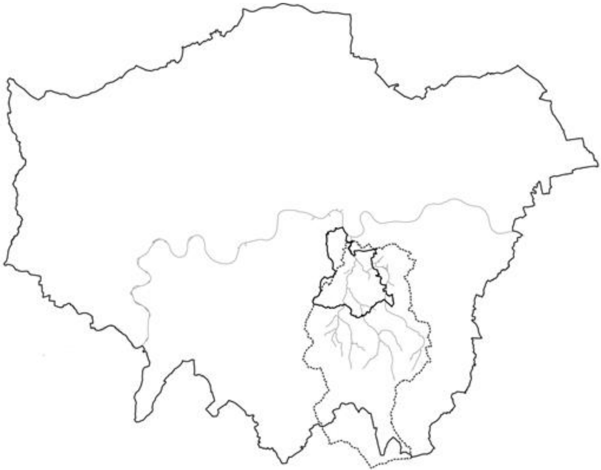
Figure 3: The catchment area of the River Ravensbourne (dotted line), with the boundaries of Lewisham and London superimposed (thick solid lines), the River Thames is also shown (thin solid line)

of the River Ravensbourne catchment and the location of the rainfall event the lead time for fluvial flooding within the Ravensbourne valley could be between 1 to 6 hours.