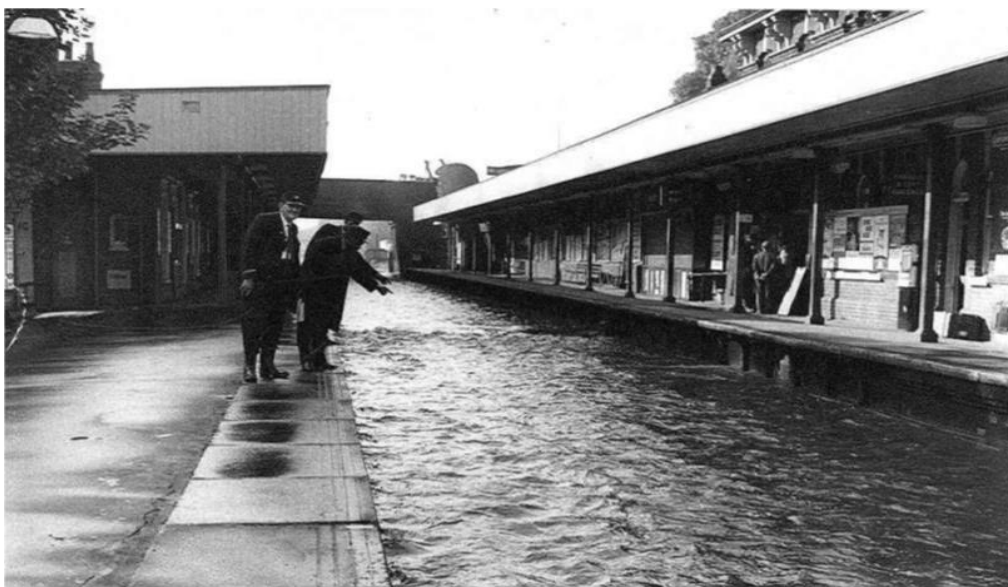
Figure 1: Catford Bridge Station September 1968