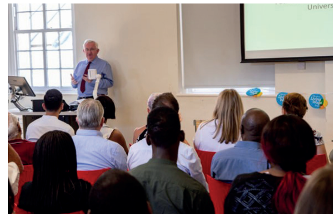
Meet the Buyer event, June 2018

Through the Lewisham Construction Hub, eight Lewisham businesses have secured contracts worth over £2,787,929.